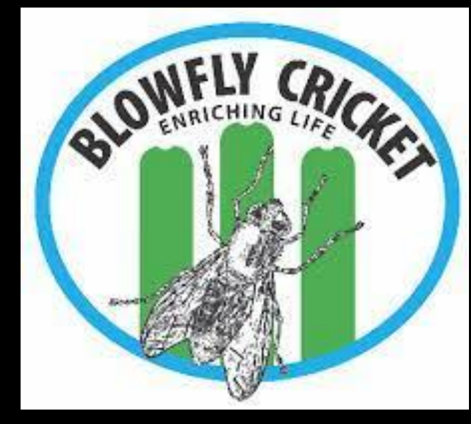
BlowFly Bulletin – Winter Edition 9<sup>th</sup> June 2023