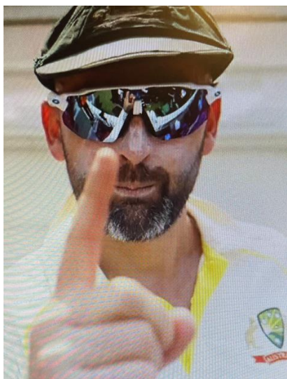
How is that Ump?